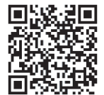
Scan here to download the app.